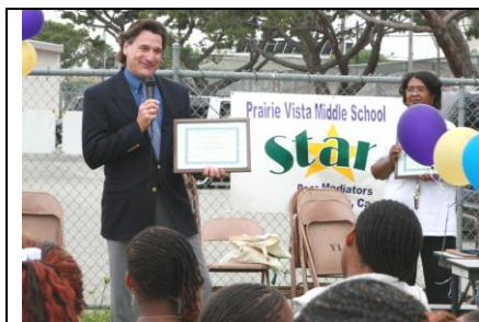
Principal of Bud Carson receives award of appreciation for his support of peer mediation program.

STUDENTS ABLE TO RESOLVE SITUATIONS (STARS) Club supports peaceful school campuses by teaching students to resolve conflicts.