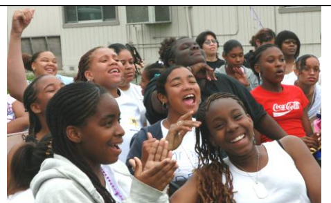
Peer Mediators cheering for each other at year end Awards Ceremony.

CYS STARS program teaches students to deal with conflicts on campus through peer mediation instead of aggression. Volunteerism is an integral component in STARS with students trained and assigned as peer mediators to conduct mediations 2 – 3 days per week between peers or teachers and students in conflict. Peer mediators can earn service learning credit as a way to support their school and learn the value of “giving back” to their community.